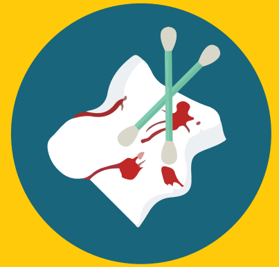
Used Swabs/ tissues