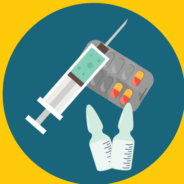
Used syringes/medicines empty ampoules